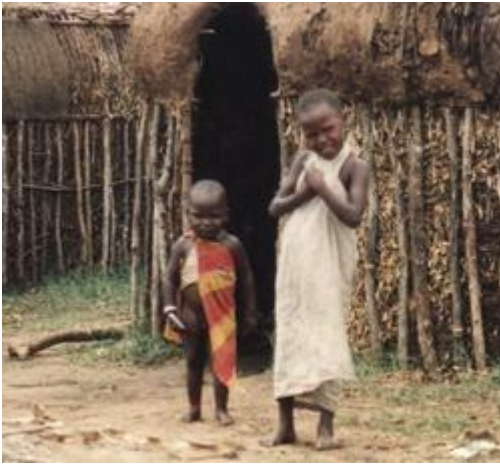
Children are beneficiaries of the Charity