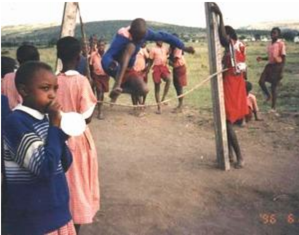
Children are playing at the school

The Maasai people who reside around the Maasai Mara have many unique problems compared to other Maasai from different areas of Maasai-land. First it should be noted that they benefit in a very little way from the tourism revenues from the Mara. They were pushed out of their prime lands to create the majestic Mara into less attractive areas in terms of economic viability . To aggravate their already desolate situation many unplanned and haphazard tourist lodges and Camps have been built along the streams and rivers which the residents depend on for water both for themselves and their livestock and this has led to an escalation in water borne diseases among the people and an increase in the wildlife/human conflict.