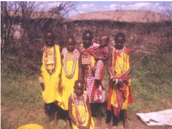
Maasai Girls at a Celebration